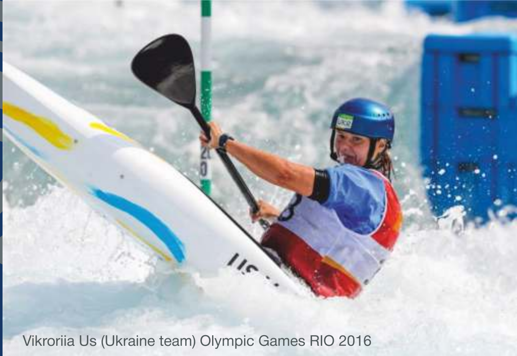
Viktoriia Us (Ukraine team) Olympic Games RIO 2016